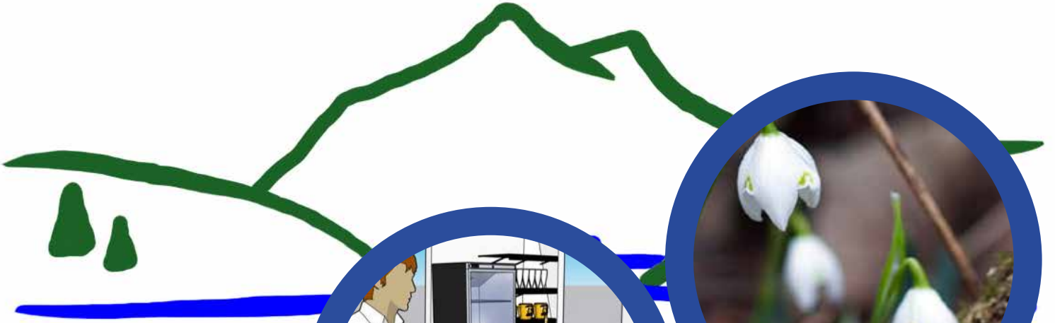
Pic Right: New kitchen design image Pic Below: Trustees clearing out the old kitchen